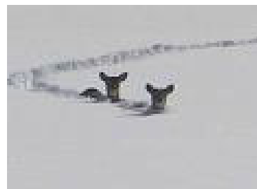
Winter on Rosebud Reservation brings deep snows and cold winds.